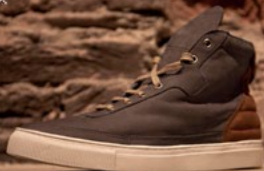
High Tops Grey Suede