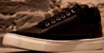
Low Tops Black Leather & Suede