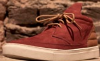
Desert Boot Bordeaux Suede