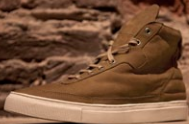
High Tops Sand Suede