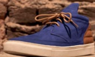
Desert Boot Blue Suede