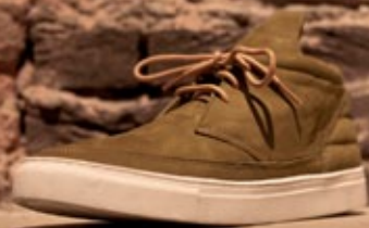
Desert Boot Sand Suede