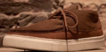
Boat Tops 'Guni's' Mustard & Brown Suede