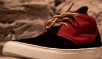
Desert Boot Patchwork Red & Black Suede