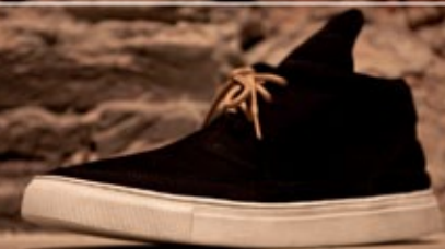
Desert Boot Black Suede