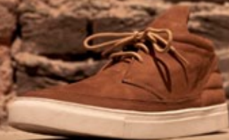
Desert Boot Mustard Suede