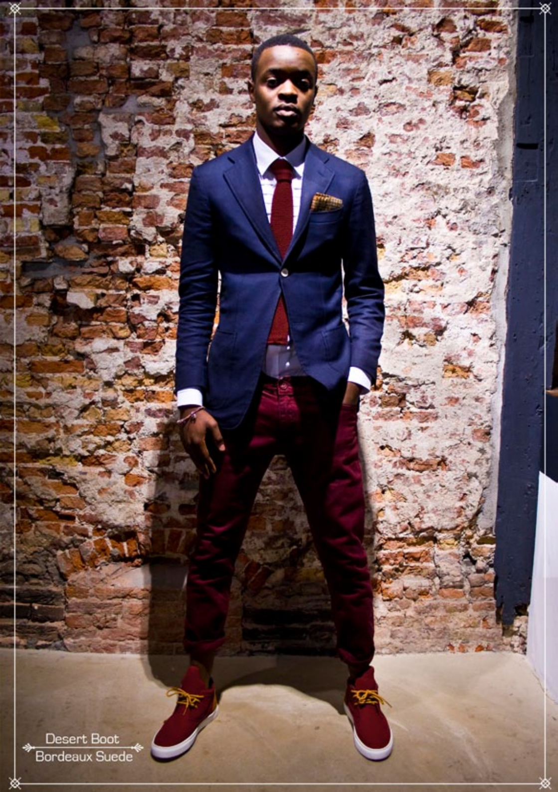
Desert Boot Bordeaux Suede