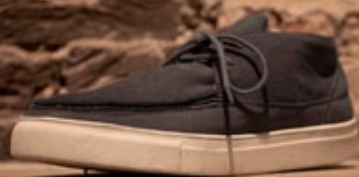
Boat Tops Grey Suede