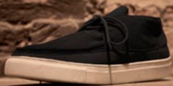
Boat Tops 'Piewi's' Black Suede