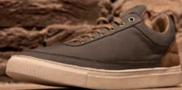
Low Tops Patchwork Grey & Sand Suede