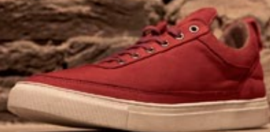
Low Tops Red Suede