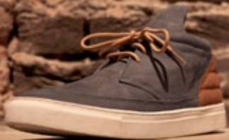
Desert Boot 'Clem's' Grey & Nubuck Suede