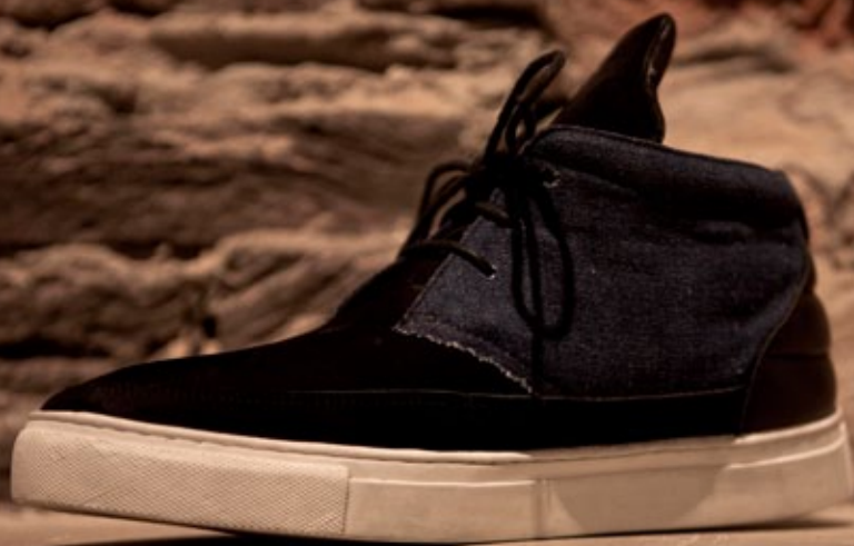
Desert Boot 'Huzane's' Denim & Black Suede