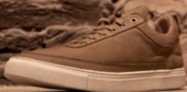
Low Tops Sand Suede