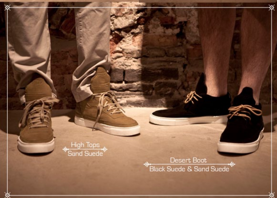
High Tops Sand Suede