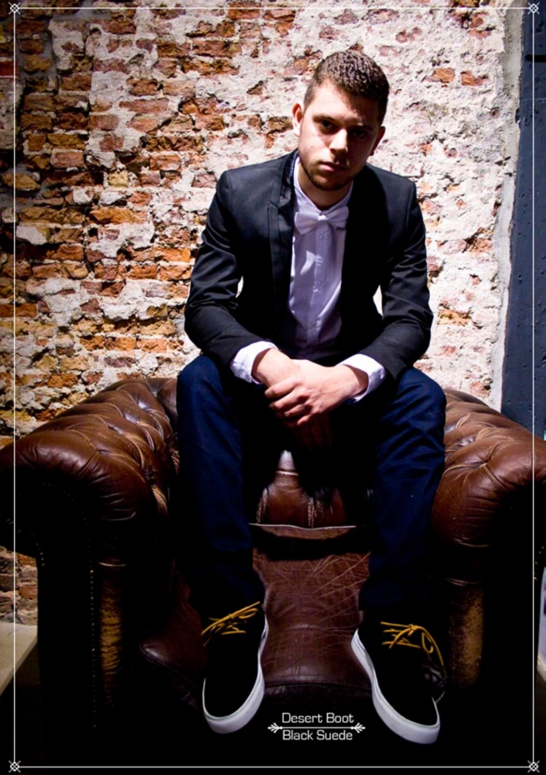
Desert Boot Black Suede