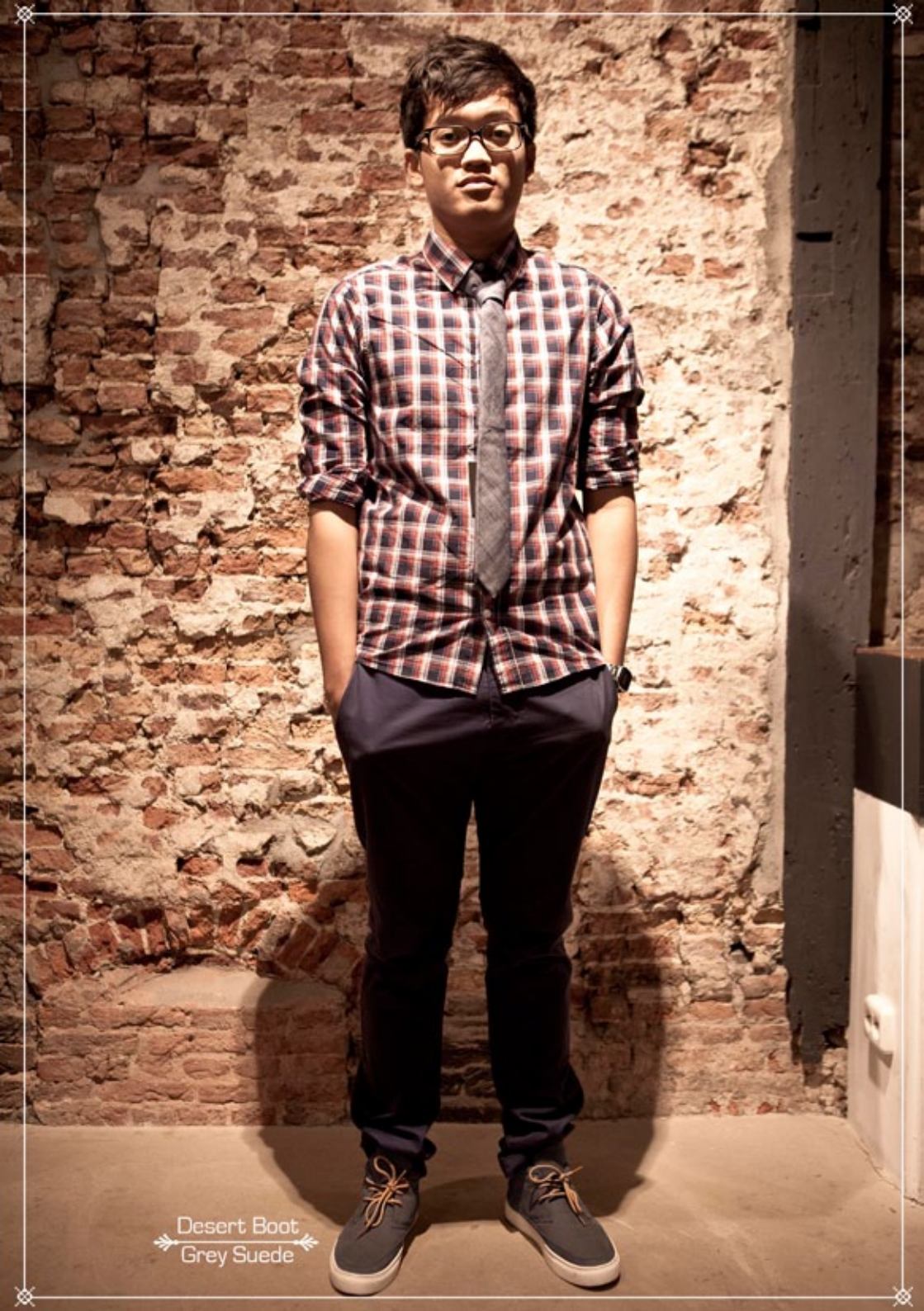
Desert Boot Grey Suede