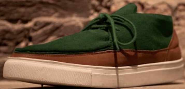
Boat Tops 'Swardin Polo's' Green & Mustard Suede